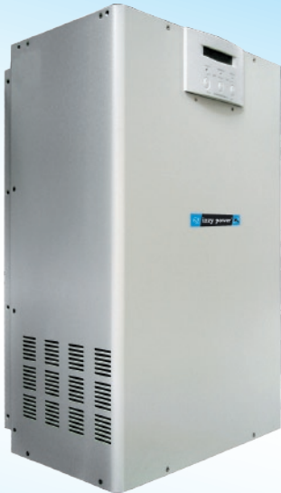
Remote control connector